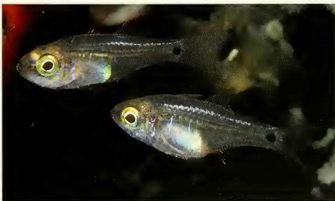
Figure 6. Zorania viridiventer at Karang Elmas Reef, Halmahera.